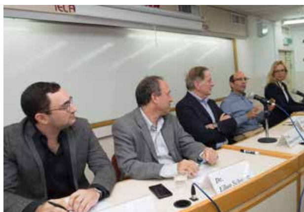
The workshop's panel