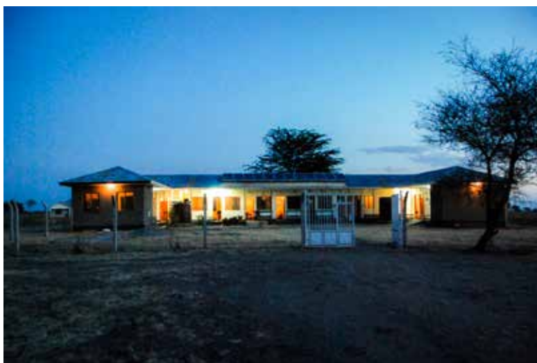
The effort – and result: Solar power for the health center