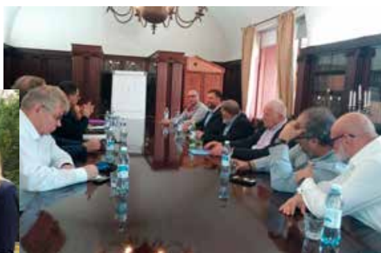
BMI Board members