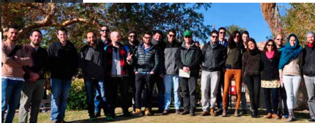
TAU group at a solar field