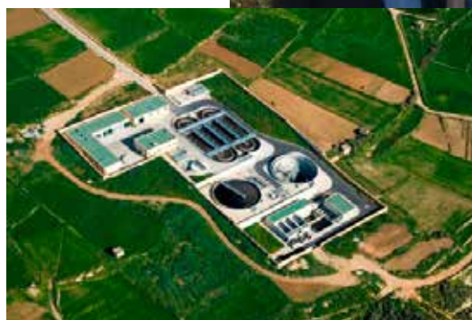
A water treatment plant in Malta